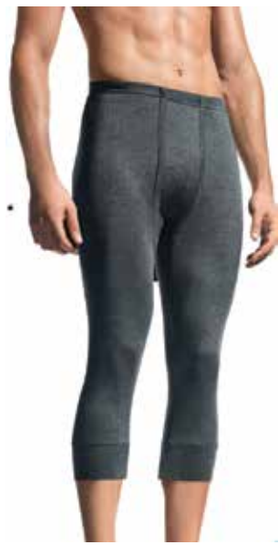
Thermo short pyjama