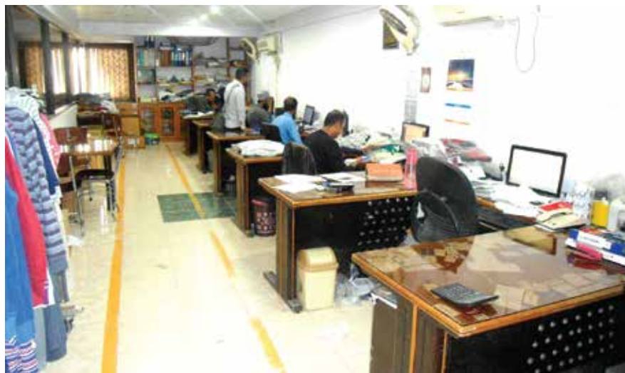
merchandising + development designing dept